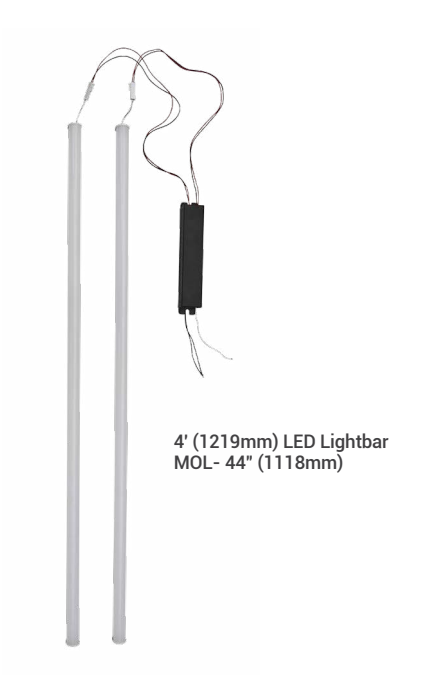
The UR Series upgrade kit ships as two components: lightbars and driver. Each component must be ordered separately.

Fully assembled kit is composed of two components that must be ordered separately. Example: Lightbar : UR 48 35K FD LB 2 + Driver : UR2 48 45L 10V FD DR